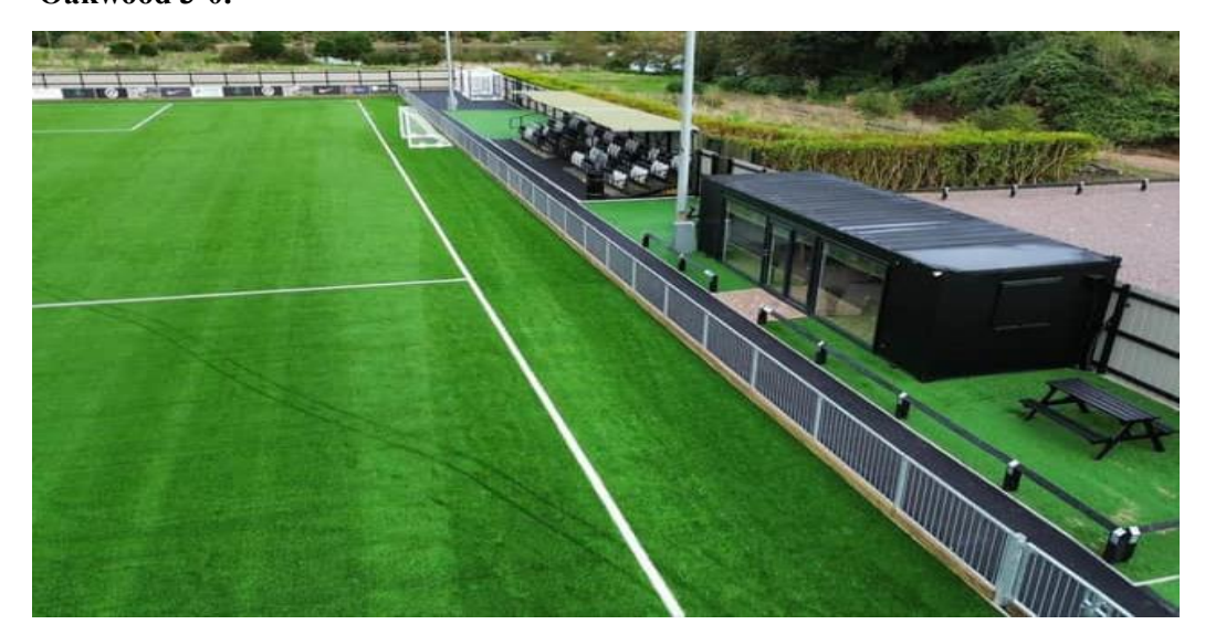
United's new facilities and 3G playing surface

Despite the heartbreak of the FA Vase defeat, United sealed a memorable season by securing the SCFL Division Two title on St Georges Day by defeating Oakwood 3-0.